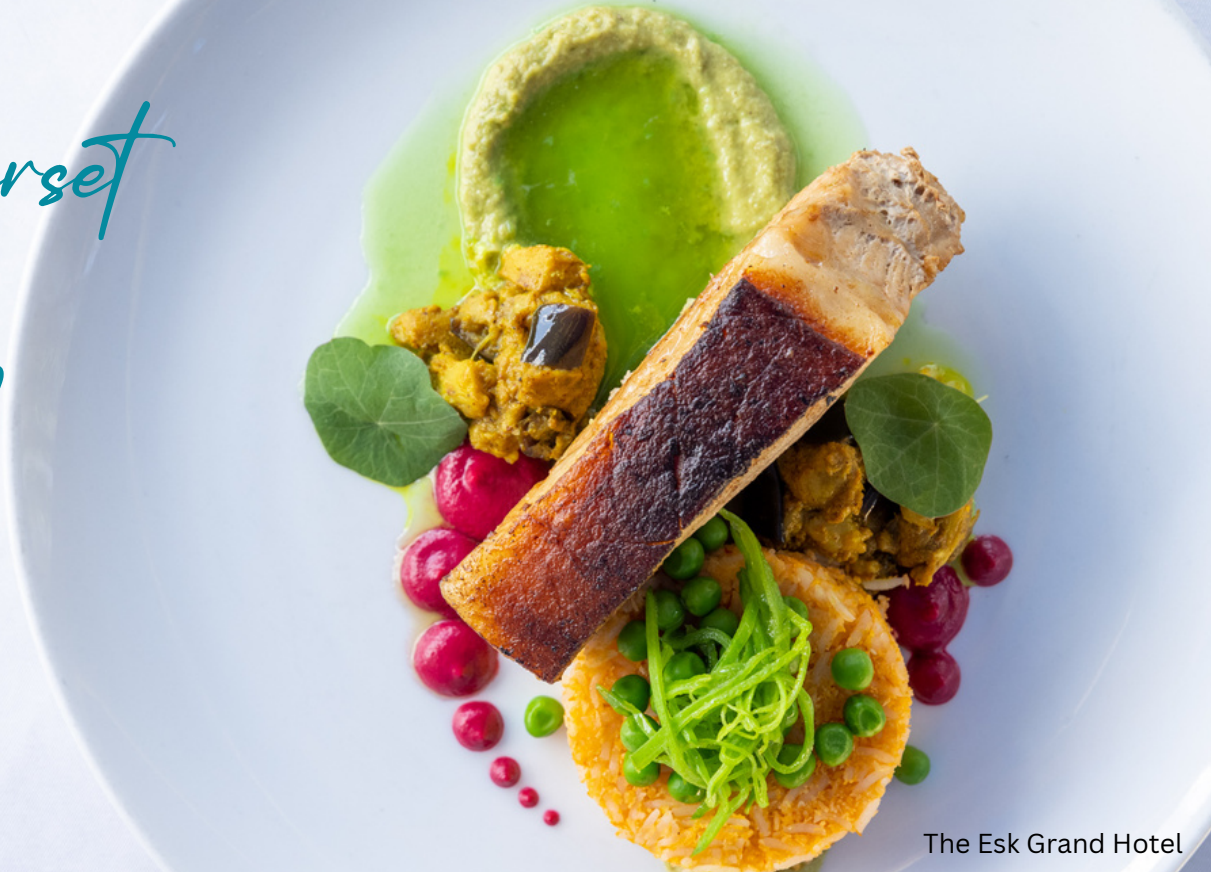
The Esk Grand Hotel