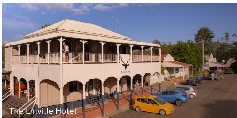
The Linville Hotel