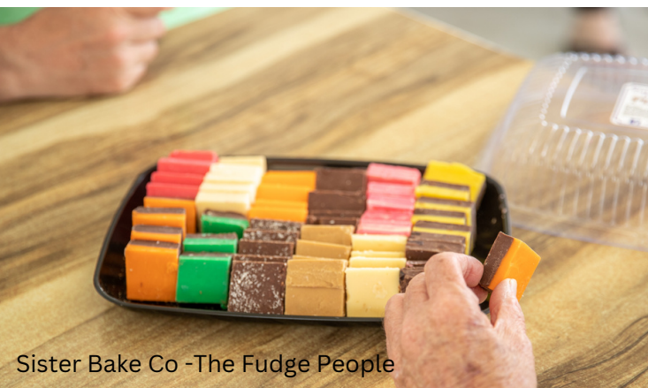
Sister Bake Co -The Fudge People